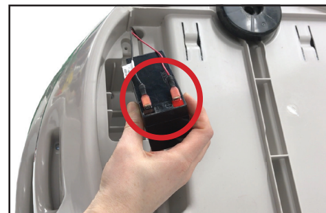
Connect leads to terminals according unit's serial number