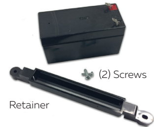
12 VDC, 1.3Ah Battery

When power is interrupted, the unit will automatically switch to battery power and a yellow light will illuminate the Power button on the Control Panel. To conserve energy, the Night Light will not function. The Litter-Robot will switch back to household power when it returns, and the unit will begin recharging the battery. Backup Battery Kits can be ordered at www.litter-robot.com .