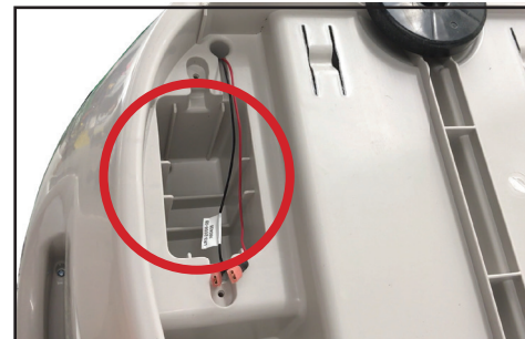
Battery pocket on underside of Base with leads